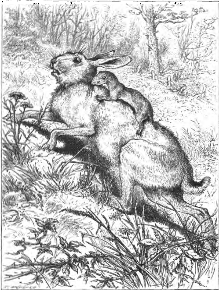
WEASEL KILLING A HARE.—(PAGE 63.)